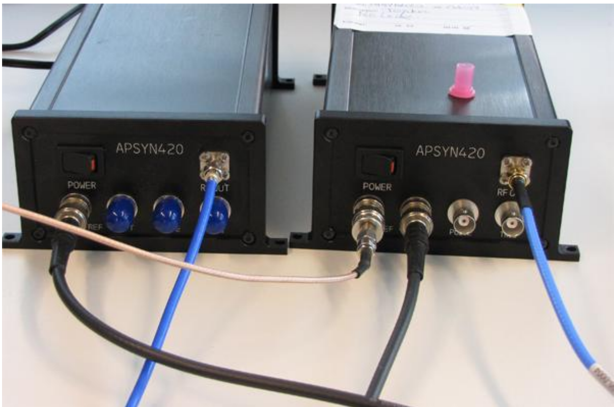
Figure 1: Test setup

Figure 1 shows the test setup to determine the level of phase stability (coherence) between two APSYN420C frequency synthesizers programmed to 16 GHz output. An APPh Signal source analyzer is used to monitor the phase stability between two RF channels over a long time interval, in this case approx. 9 hours.